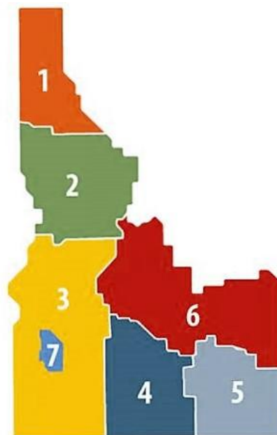
Counties represented in each region:

Region 6: A group with St. Vincent de Paul society saw a need for an emergency housing shelter for families. This group has been meeting for over a year to learn about housing and to look for a property that would be appropriate for this purpose. The First Presbyterian Church owns a home that was previously used by the Idaho Youth Ranch as a home for youth. These two groups have joined together to support this project. The home is being provided by the First Presbyterian Church and the staffing will be provided by the St. Vincent de Paul society group. They expect this project to open this spring/summer.