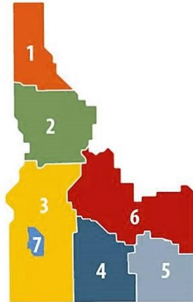
Counties represented in each region:

Boise City/Ada County CoC: Reported that Housing was the #1 goal in terms of what is needed in the area. Several members would like to see initiatives on youth homelessness. Discussions also centered around CE and the VI-SPDAT to make sure there are no Fair Housing violations. There was also a presentation from Pathways about how they can help.