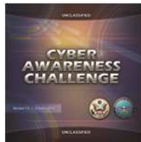
CyberAwareness Challenge (for DoD and Federal Personnel) October 2012